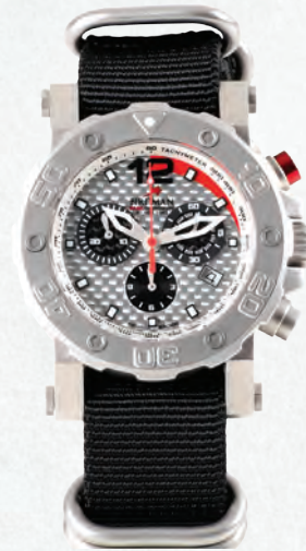
B.A.S.E. CHRONOGRAPH BC-W2-13