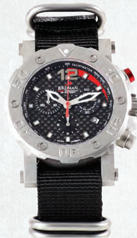
B.A.S.E. CHRONOGRAPH BC-B2-13