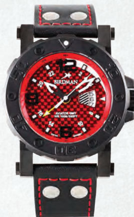
AVIATOR GMT AG-R1-13