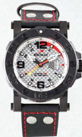
AVIATOR GMT AG-W1-13