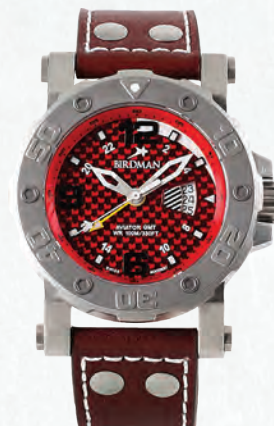
AVIATOR GMT AG-R2-13