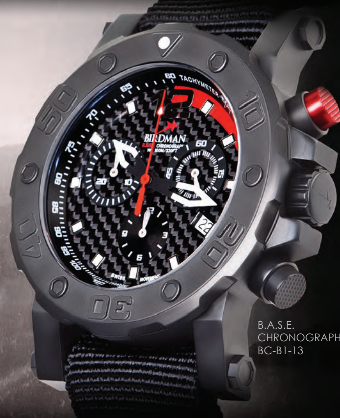
B.A.S.E. CHRONOGRAPH BC-B1-13