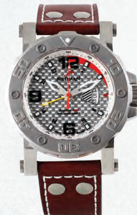
AVIATOR GMT AG-W2-13