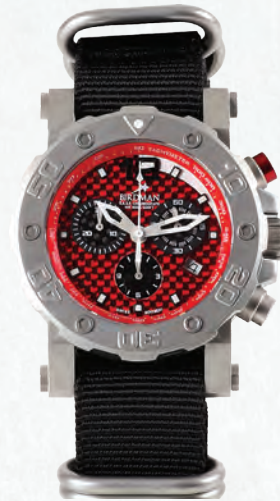
B.A.S.E. CHRONOGRAPH BC-R2-13