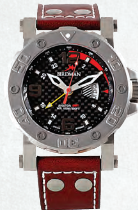
AVIATOR GMT AG-B2-13