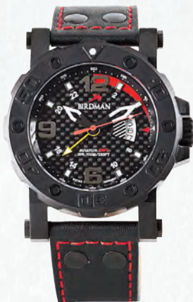
AVIATOR GMT AG-B1-13