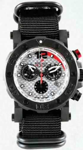
B.A.S.E. CHRONOGRAPH BC-W1-13