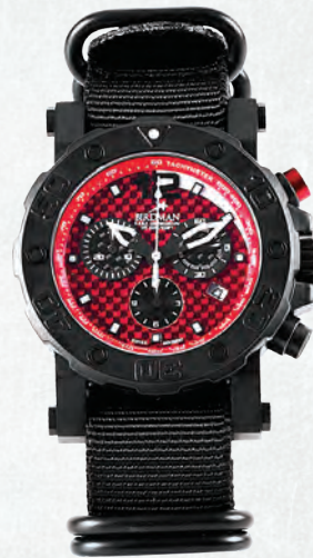
B.A.S.E. CHRONOGRAPH BC-R1-13