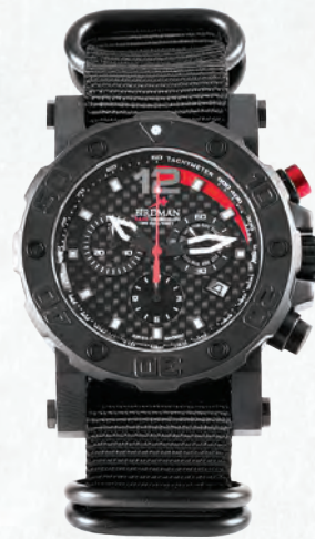
B.A.S.E. CHRONOGRAPH BC-B1-13