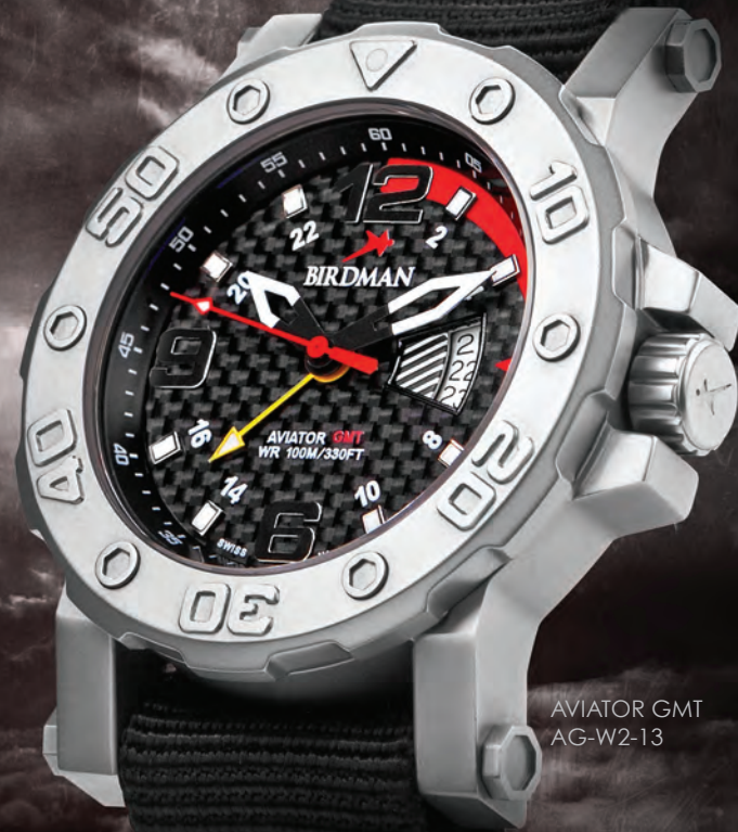
AVIATOR GMT AG-W2-13